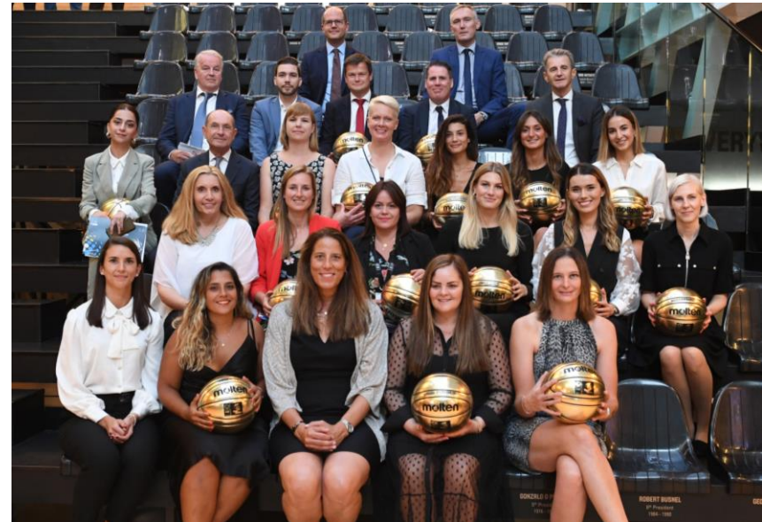
WiLEAD – Cohort 1